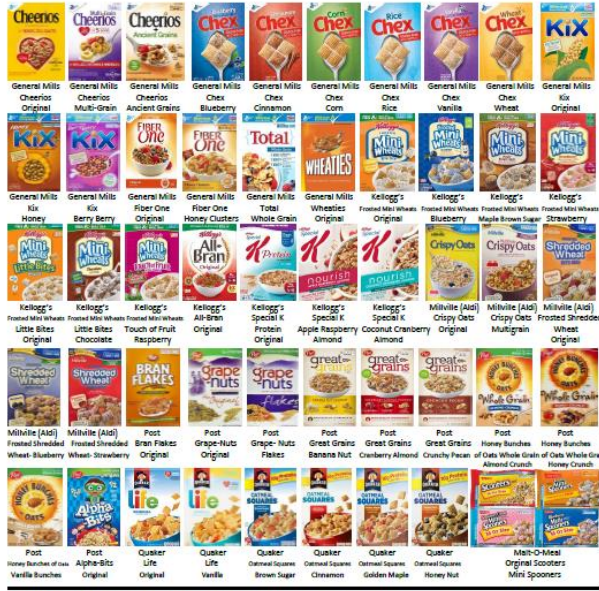
Cereals Within Sugar Limit but NOT Whole Grain-Rich